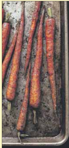
FOOD FOR FRIENDS/ADRIEN MUELLER

Fill each squash half with ½ to ¾ cup of the rice mixture and serve.