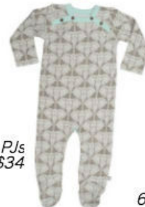
5. Organic PJs $34