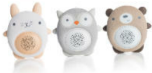
1. SoundBub Bluetooth Speaker $59

Many of the Pregnancy Magazine picks are brought to you by independently owned companies with moms just like you at the helm. Many of the options below are affordable (with some priced as low as $7!) and lean heavily toward being sustainably sourced and friendly to the earth. All of the items you'll find below have been tested first-hand and loved by the Pregnancy editors.