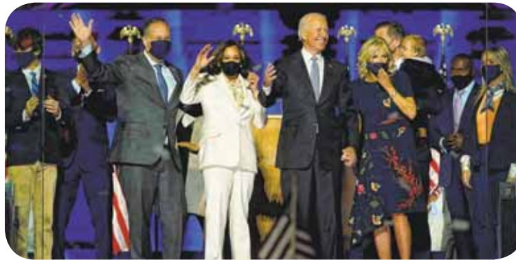
President-elect Joe Biden and Vice President-elect Kamala Harris celebrate their victory with their families in Wilmington, Delaware on Nov. 7, 2020.

The program will feature New York natives Lady Gaga, who will sing the national anthem, and Jennifer Lopez, who will provide a musical performance. Speakers will